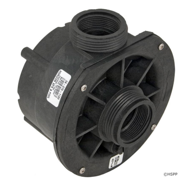
D. Vico Ultimax